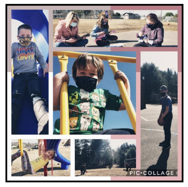
Fun in the Sun

We were blessed with some gorgeous weather the week before April Break, and we took full advantage of soaking in the sun and some much needed Vitamin D.